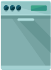
1 – a dishwasher

| a dishwasher | a frying pan | a glass | a chair | a couch | drawers | a bowl | a dustpan | an alarm clock | an extractor | a fence | a corkscrew | a broom | a cupboard | a boiler / a kettle | a fork | a glove | a fridge | a blender | a bathtub